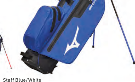
MIZUNO LW-C CART BAG